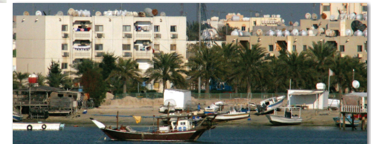
SATELLITE DISHES LINE APARTMENT BUILDING ROOFTOPS IN THE ARABIC COUNTRY OF BAHRAIN IN THE PERSIAN GULF.